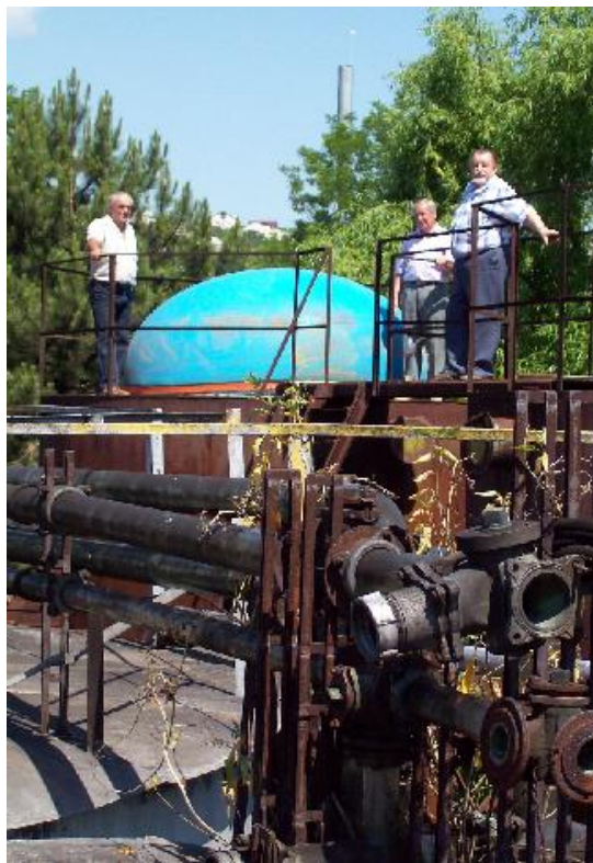
FIGURE 2. General view of the biogas reactor at Bardar Winery, Moldova

The proposed technology of wastewaters anaerobic treatment in the bioreactors with fixed microflora (anaerobic biofilters) was tested at the „Bardar-Vin” S.A. Company in Moldova. The 36-m 2 pilot anaerobic biogas reactor has been constricted (Fig.2), at which the regimes of biogas technology of anaerobic fermentation of winery vinasse have been tested in view to determine the optimal operation parameters. To make the construction cheaper, the reservoirs and other auxiliary equipment are available at the winery. This made it possible to reduce the capital costs. As a substrate for microflora fixation, the dried grapevine was used with the diameter of 2-3 mm and package density under the compression 3-5 kg/dm 2 . The grapevine had the composite curved form, is stable under the conditions of anaerobic fermentation of winery wastewaters, ensures the good adhesion of microflora on its surface. Its active summary surface was 100-120 m 2 /m 3 of bioreactor bulk. As a gasholder, the elastic polypropilene tissue (thickness 1 mm) was used.