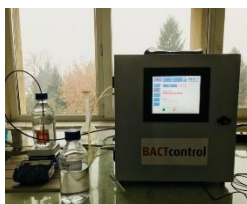
Figure 3. BactControl device

The difference between clean water and the water without disinfection is big, does not matter the determination. We can see the progressive growth for other types of water. The purpose of this device was reached, can be use for microbiological contamination warning. The big problem for this device, at this time, is that it have a reaction chamber that include a membrane. After a couple determination, the reaction chamber must be cleaned, because the membrane has been dirty.